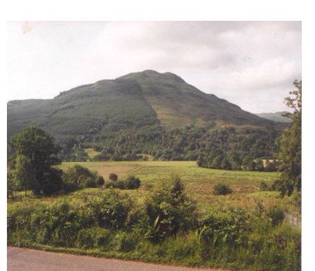
View from Cottage