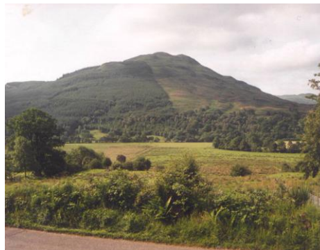
View from Cottage